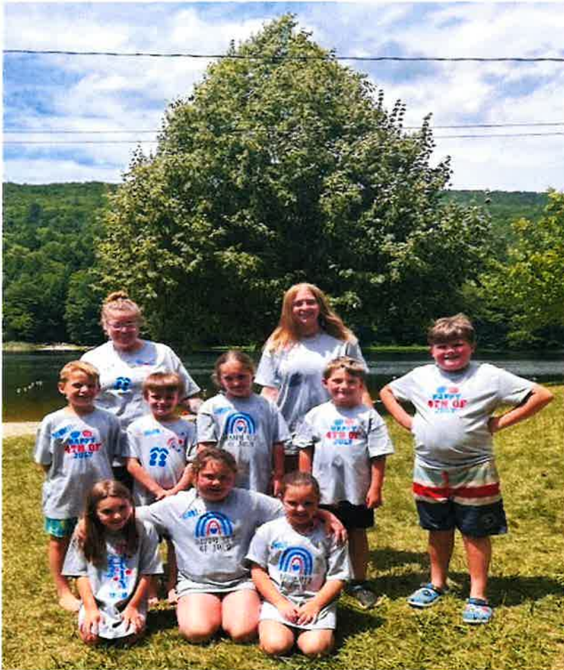
Wallingford's Summer Rec Program Fun!

Hours: Monday, Wednesday-Friday 10 a.m.-4 p.m.; and Saturday 9 a.m.-1 p.m. 802-446-2685