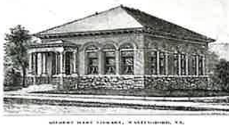
GILBERT HART LIBRARY, WALLINGFORD, VT.