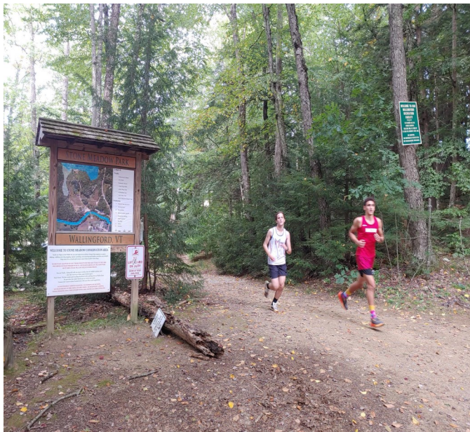
Mill River used the town's rec field and Stone Meadow for their 5k cross country meet on 9/23.