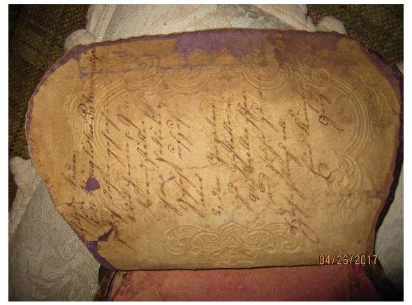
Inside Purse Flap with Old German Writing

The delicate tan leather purse features a metal clasp and ornate border. The lining of the purse was imprinted with "old" German handwriting that was partially translated into phrases like "should I therefore follow obediently,"... "request petition"....and "I, the gentleman."