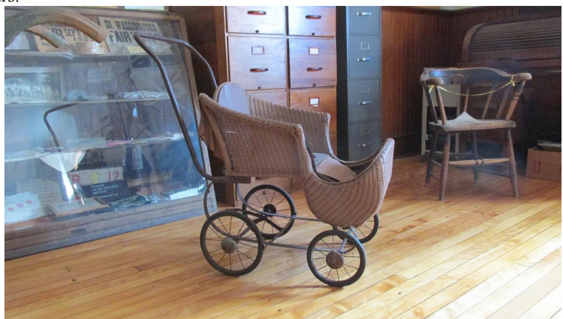
Hedstrom Union Wicker Stroller